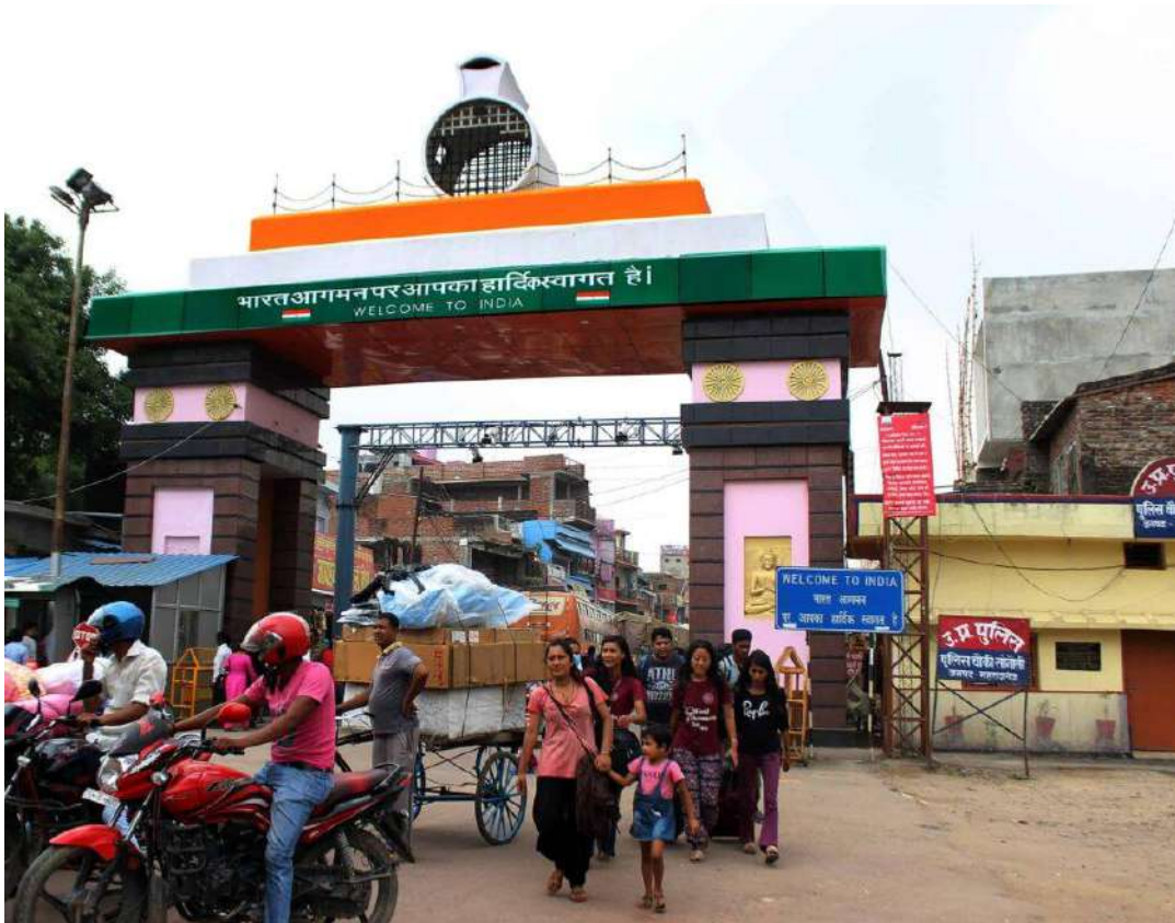
India nepal relations upsc

Another area where India and Nepal can collaborate is in the area of tourism. Nepal has a lot of potential as a tourist destination, with its rich cultural heritage and natural beauty. India can help Nepal in developing its tourism industry by providing technical assistance and sharing best practices.